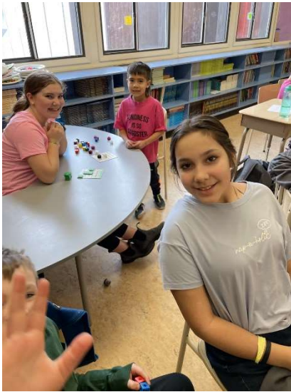
Buddy classes playing bingo!