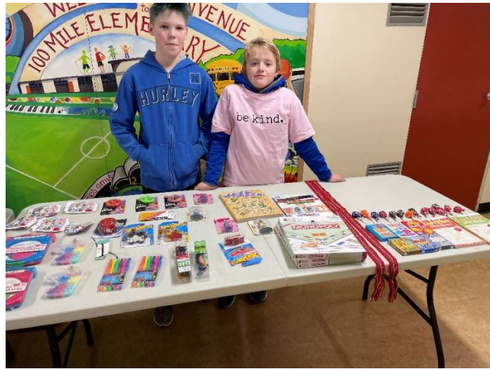
One of the prize tables for bingo.